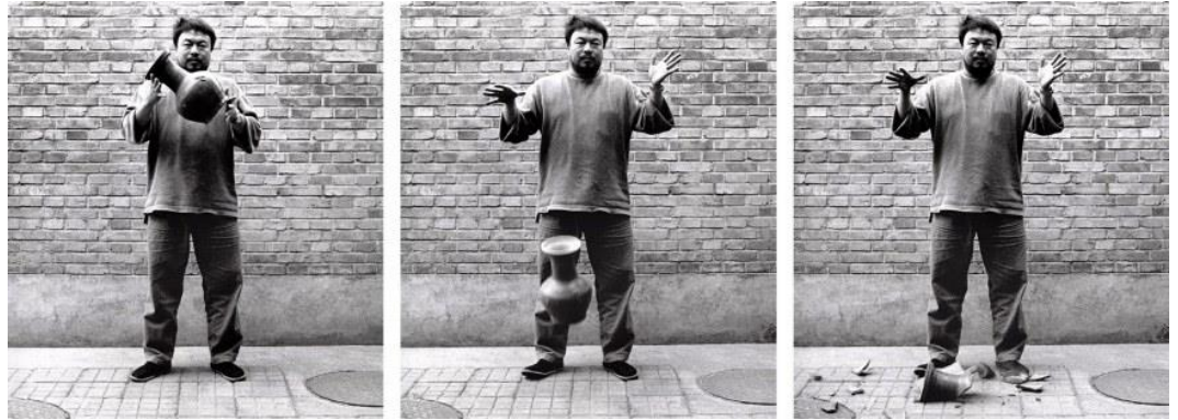
Dropping a Han Dynasty Urn

Who better to ask about the responsibilities of an artist than Ai Weiwei ? What can art achieve in a time when dissidents are locked up and journalists murdered without so much as a second thought? How far can the artist go? How far should he go? Ai Weiwei lectured on invitation of the Nexus Institute : The Responsibilities of an Artist